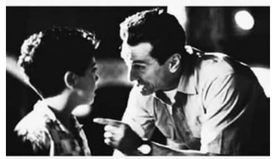
But try and get up every morning day after day, and work for a living. Let's see him try that. Then we'll see who the real tough guy is. The working man's the tough guy."